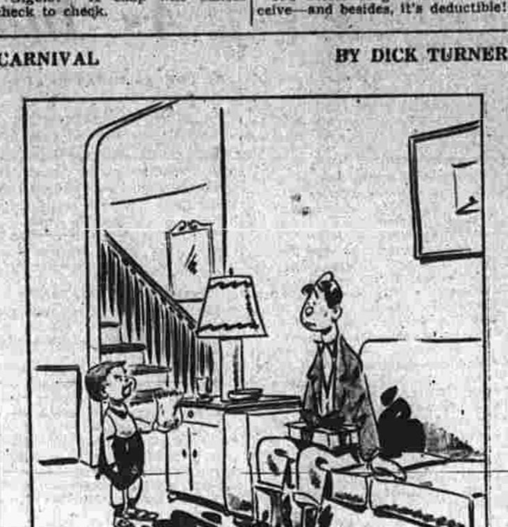
BY DICK TUNNER