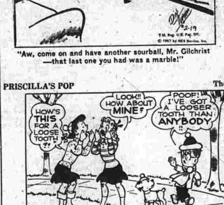
BY AL VERBER